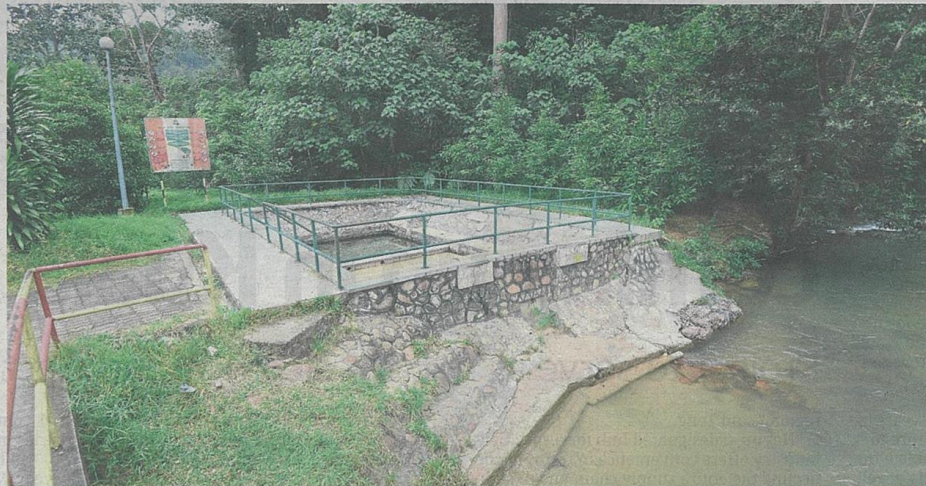
Before the MCO, Kerling hot springs was a favourite among visitors to Hulu Selangor.

Shutdown proves timely for Selayang attraction as it gets much-needed facelift