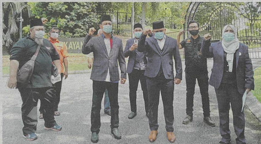
Lebih 25 NGO Selangor meminta isu peniaga warga asing diberi perhatian selepas menyerahkan memorandum kepada Sultan Selangor di Istana Bukit Kayangan, Shah Alam semalam.

“Kami sebagai peniaga dan usahawan di negeri ini terkesan kerana kerenah birokrasi pihak penguat