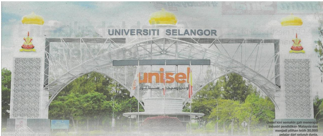
Unisel kini semakin gah menerajui industri pendidikan Malaysia dan menjadi pilihan lebih 30,000 pelajar dari seluruh dunia.